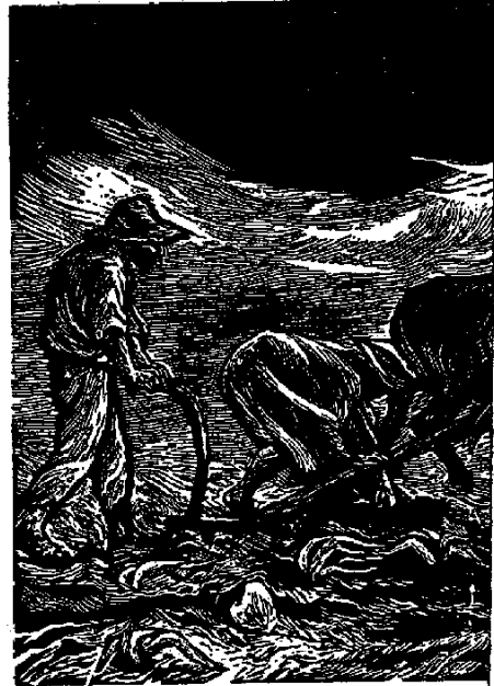
Turning the soil

Their real aim is to continue to ruin the peasants, to kill two birds with one stone: on the one hand,